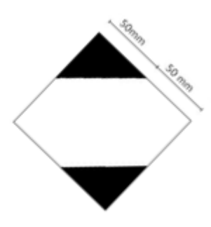
Fig. 1 Signal for containers with limited quantities.