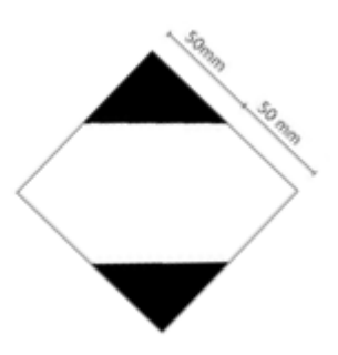
Fig. 1 Signal for containers with limited quantities.

According to NOM-011-SCT2/2012: 5.11 It is not necessary that containers/packages with hazardous substances or materials in limited quantities, have the Official Transport Name or UN number but must have the signal in Fig. 1. This signal must be clearly visible, legible and must be capable of withstanding weather exposure without suffering any degradation.