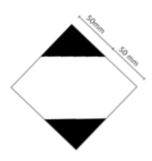
Fig. 1 Signal for containers with limited quantities.

According to NOM-011-SCT2/2012: 5.11 It is not necessary that containers/packages with hazardous substances or materials in limited quantities, have the Official Transport Name or UN number but must have the signal in Fig. 1. This signal must be clearly visible, legible and must be capable of withstanding weather exposure without suffering any degradation.